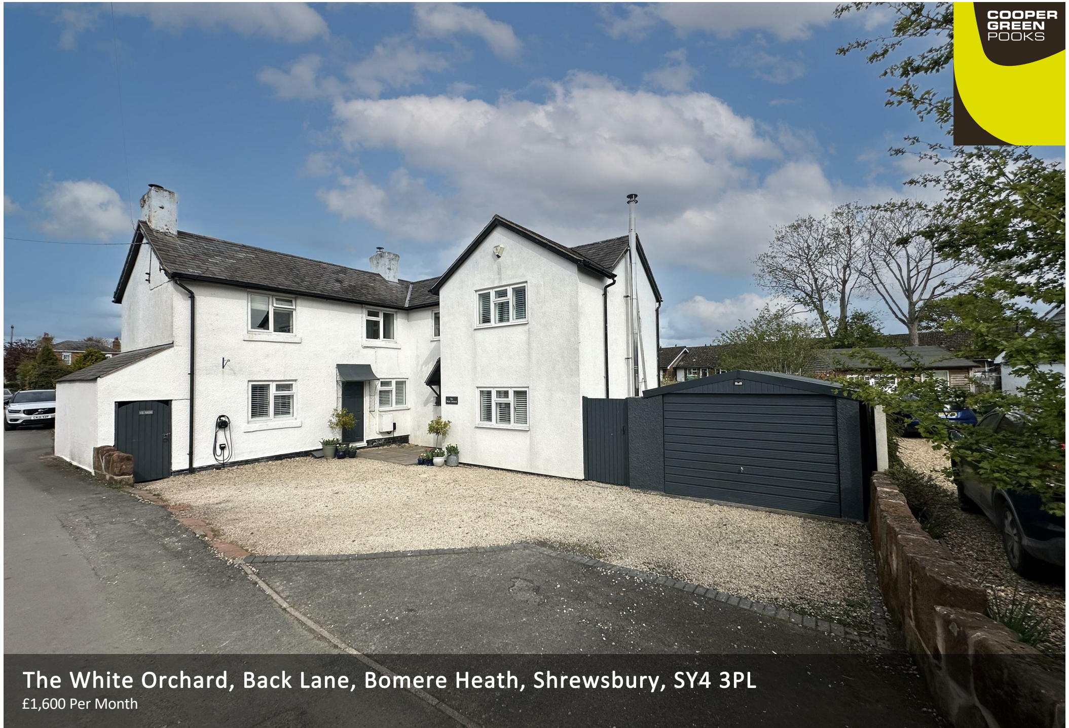
The White Orchard, Back Lane, Bomere Heath, Shrewsbury, SY4 3PL £1,600 Per Month